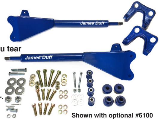
Shown with optional #6100

NOTES: Lay out and verify all parts you may need are accounted for before you tear down your Bronco. This is especially important if you have a rented space or if a mechanic/shop is doing the install. We recommend that you have a caster reading taken at a front end alignment shop before installation to assure you have the proper degree bushing, so you won't be held up waiting for them or have to tear it back down and reinstall. We recommend a reading of 3.5 to 4.5°. Too much or too little will result in caster shimmy or wandering. Take into consideration when calculating for the proper bushings, there is 4.25°+ built into these arms. Also, give your track bar a quick shake and inspection to check the condition of the bushings. It will be disconnected and they'll be easy to replace.